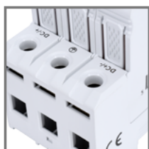
terminal capacity max. 35mm 2