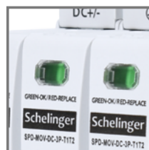
status indicator: green - element working red - replacement necessary