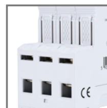
possibility of connecting by means of busbars